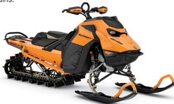
SUMMIT EXPERT 154 850 E-TEC TURBO R SHOWN

The ultimate precise and predictable deep-snow sled with features sharpened for most technical terrains.