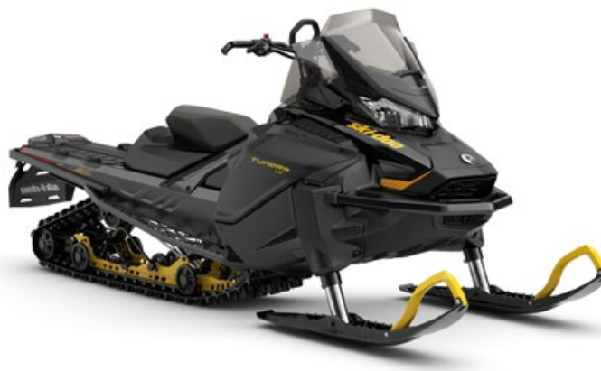
TUNDRA LE 600 EFI SHOWN

Great off-trail and deep snow performance with light-utility capability.