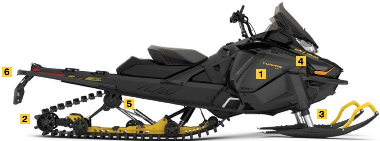
TUNDRA LE 600 EFI SHOWN

Industry-exclusive telescopic front suspension enables a large, flat belly pan for exceptional deep snow flotation.