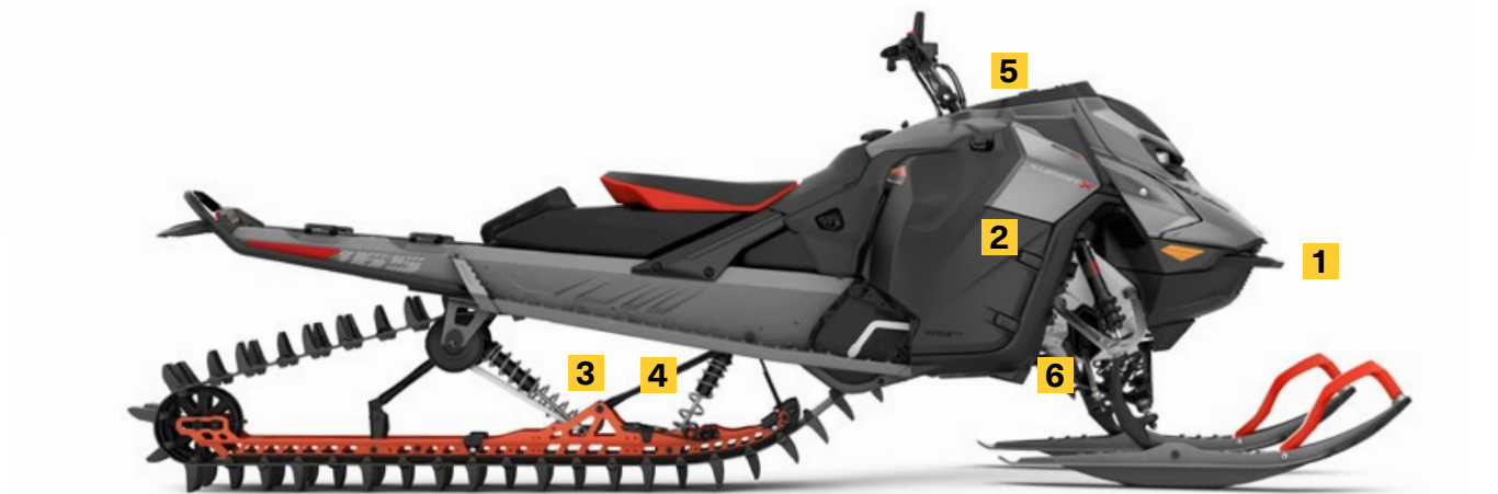
SUMMIT X 154 850 E-TEC TURBO R SHOWN

Lighter than ever before with a quicker suspension response underlining its agility and high degree of playfulness.