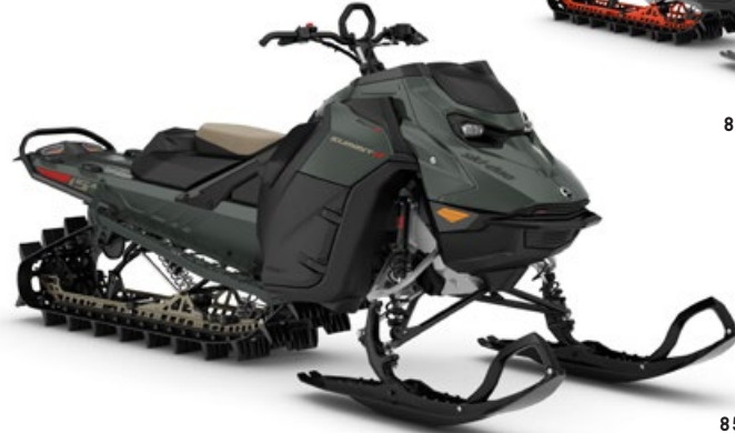
SUMMIT X 165 850 E-TEC TURBO R SHOWN