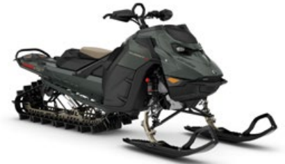
SUMMIT X WITH EXPERT PACKAGE 154 850 E-TEC TURBO R SHOWN

The ultimate precise and predictable deep-snow sled with features sharpened for most technical terrains.