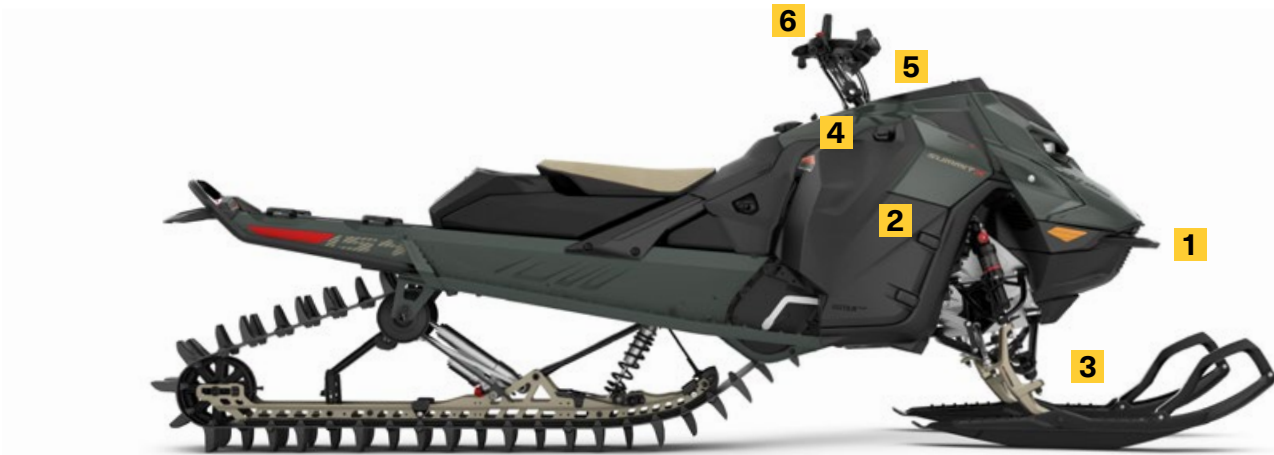
SUMMIT X WITH EXPERT PACKAGE 154 850 E-TEC TURBO R SHOWN

Narrower 32 in. ski stance unlocks the tightest, steepest and most challenging technical terrains with the most precise and predictable sidehills no matter the conditions.