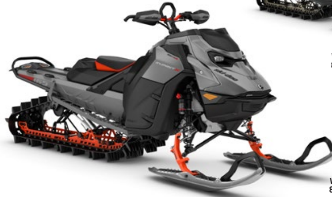
SUMMIT X WITH EXPERT PACKAGE 165 850 E-TEC TURBO R SHOWN