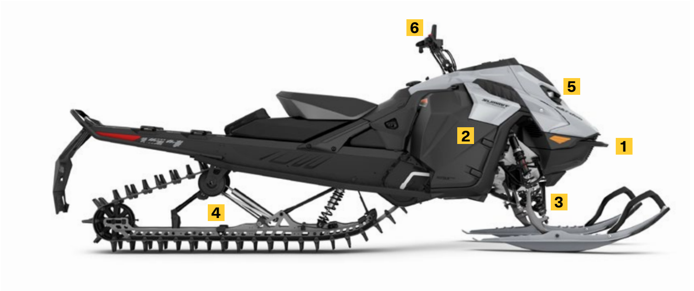
SUMMIT ADRENALINE 154 850 E-TEC SHOWN

Extremely capable high-pressure gas shocks by KYB.