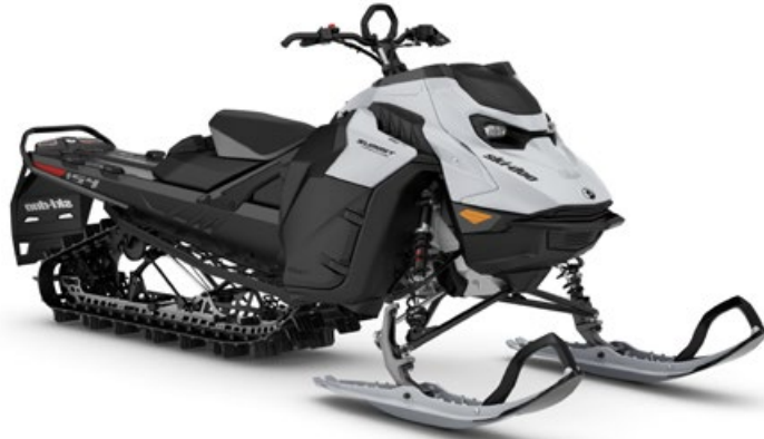
SUMMIT ADRENALINE 154 850 E-TEC SHOWN

An excellent deep-snow machine for any rider.