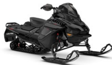
RENEGADE X-RS 900 ACE TURBO R SHOWN

A hard-charging, high-performance machine with the most advanced features and technology.