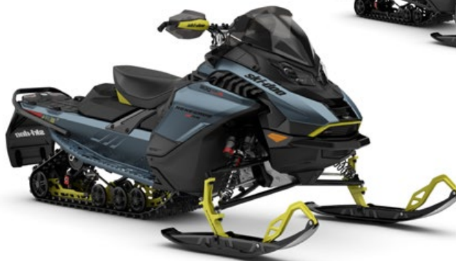
RENEGADE X-RS 900 ACE TURBO R SHOWN