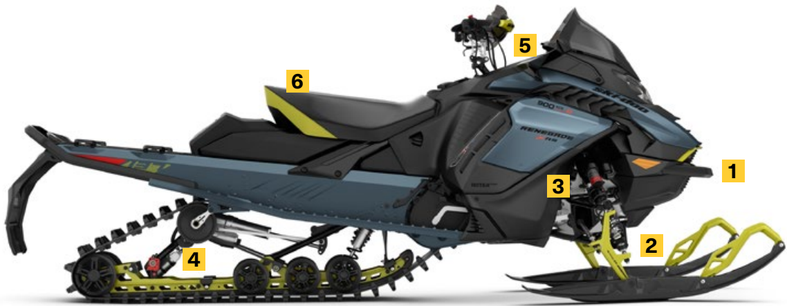
RENEGADE X-RS 900 ACE TURBO R SHOWN

Extreme capability, extreme durability shocks for control in the toughest conditions. Easy adjust-equipped for dialed in compression.