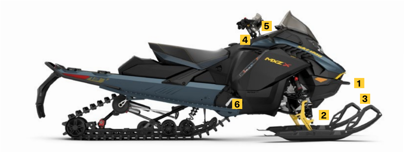
MXZ® X® 850 E-TEC® SHOWN

The aggressive design of the Pilot RX ski offers better grip, enhanced cornering and unparalleled control in all snow conditions.