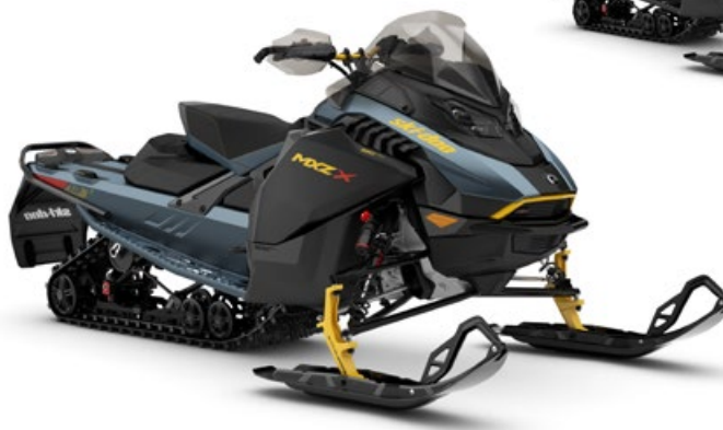
MXZ X 850 E-TEC SHOWN