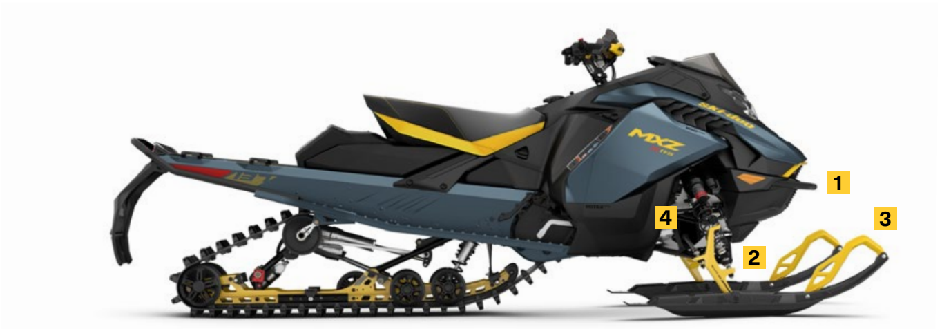
MXZ X-RS 850 E-TEC SHOWN

The aggressive design of the Pilot RX ski offers better grip, enhanced cornering and unparalleled control in all snow conditions.