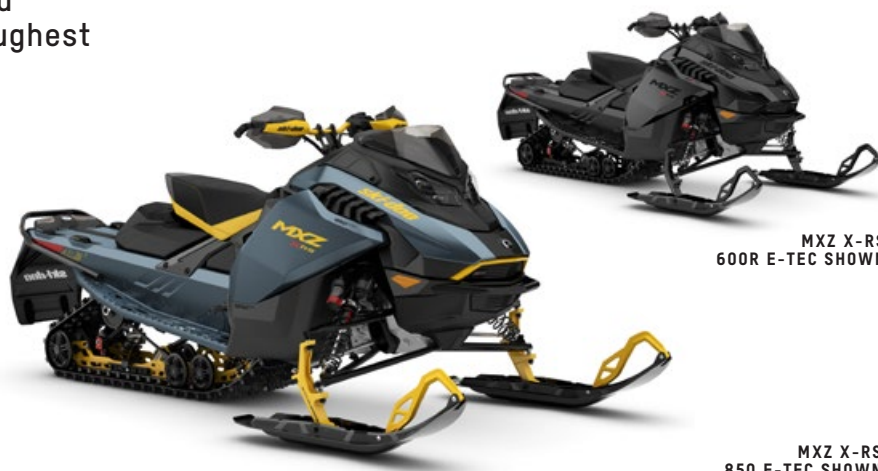
MXZ X-RS 600R E-TEC SHOWN

An uncompromising race-inspired sled capable of taking on the roughest trails with ease.