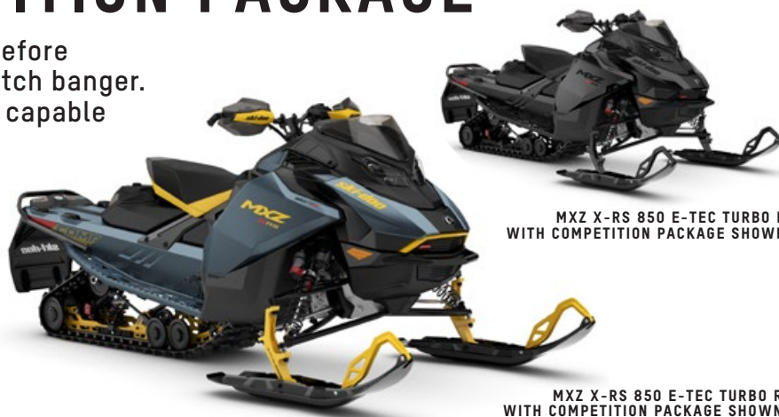
MXZ X-RS 850 E-TEC TURBO R WITH COMPETITION PACKAGE SHOWN

Yes it's an ultra-fast laker, but before anything else it's the ultimate ditch banger. Powerful, lightweight and highly capable with race-ready features.