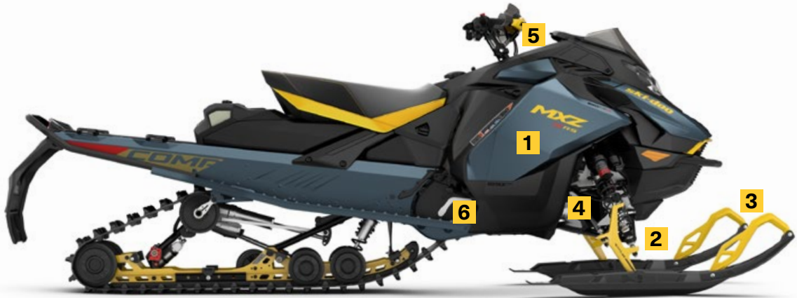
MXZ® X-RS® 850 E-TEC® TURBO R WITH COMPETITION PACKAGE SHOWN

The aggressive design of the Pilot RX ski offers better grip, enhanced cornering and unparalleled control in all snow conditions.