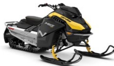
MXZ NEO SHOWN

An awesome trail sled with compact ergonomics that gives riders of any age a less intimidating experience with a full-size fun factor.