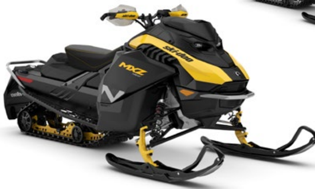
MXZ NEO+ SHOWN