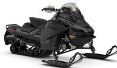
MXZ ADRENALINE 600R E-TEC SHOWN