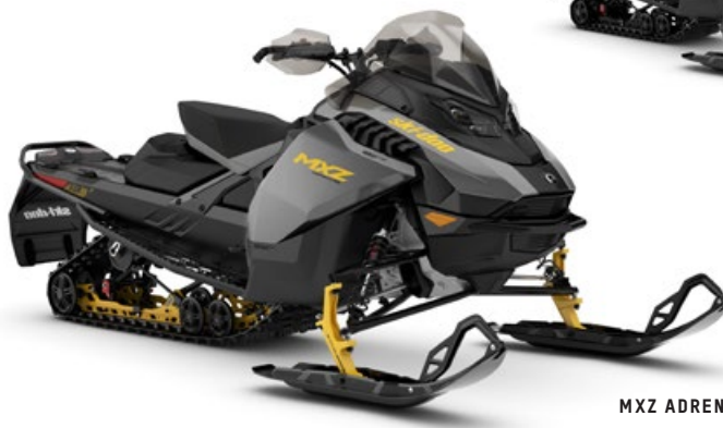
MXZ ADRENALINE 850 E-TEC SHOWN

Tight cornering, big bumps, high speed and rough trails—this sled conquers it all.