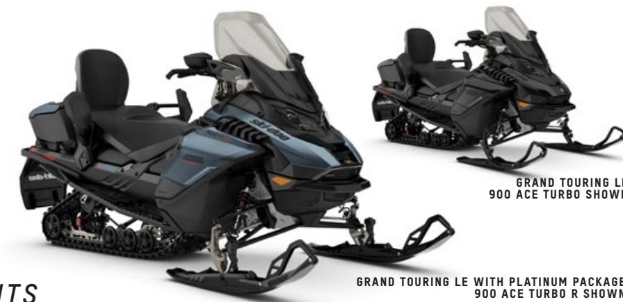
GRAND TOURING LE 900 ACE TURBO SHOWN