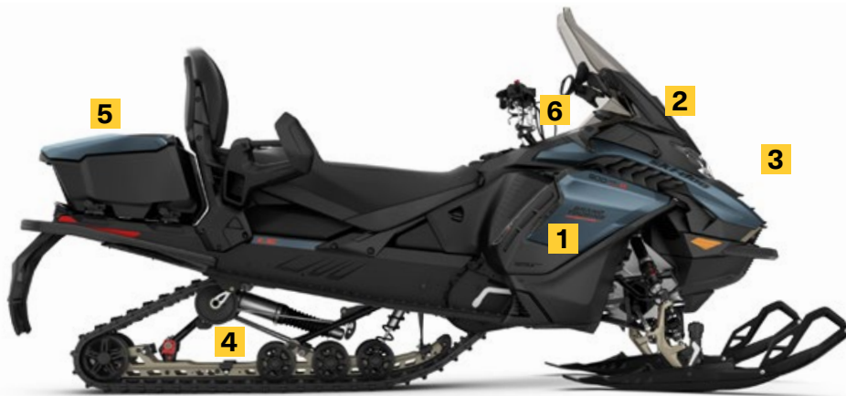
GRAND TOURING LE WITH PLATINUM PACKAGE 900 ACE™ TURBO R SHOWN

The Platinum Package includes a 10.25" touchscreen display featuring built-in GPS with Group Ride, premium LED headlights, studded 1,25" track, forward adjustable riser and Pilot TX adjustable skis.