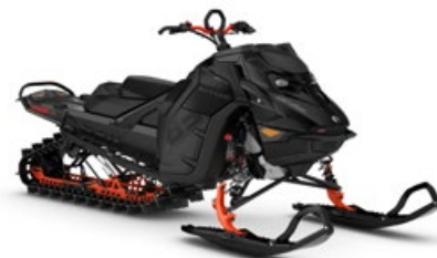
FREERIDE 154 850 E-TEC TURBO R SHOWN

Extreme capacity deep snow sled built to live large, live free and go big. The Freeride is stable and predictable at higher speed in variable snow conditions, including bigger bumps.