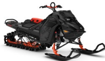
FREERIDE 154 850 E-TEC TURBO R SHOWN

Extreme capacity deep snow sled built to live large, live free and go big. The Freeride is stable and predictable at higher speed in variable snow conditions, including bigger bumps.