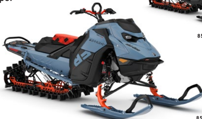
FREERIDE 154 850 E-TEC TURBO R SHOWN