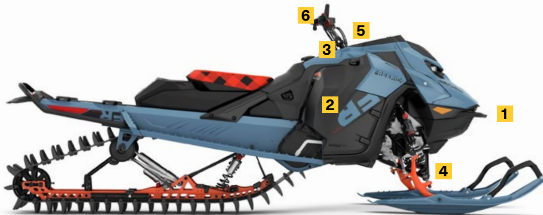
FREERIDE 154 850 E-TEC TURBO R SHOWN

Further increases steering precision at higher speed for a stable and predictable ride in less than ideal snow conditions.