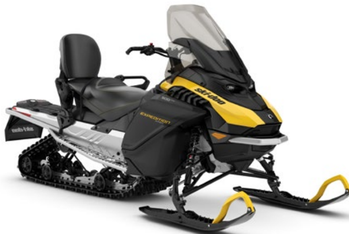
EXPEDITION SPORT 900 ACE SHOWN

Ultra-responsive chassis for on- or off-trail rides and an extensive array of sport-utility and 2-up features.