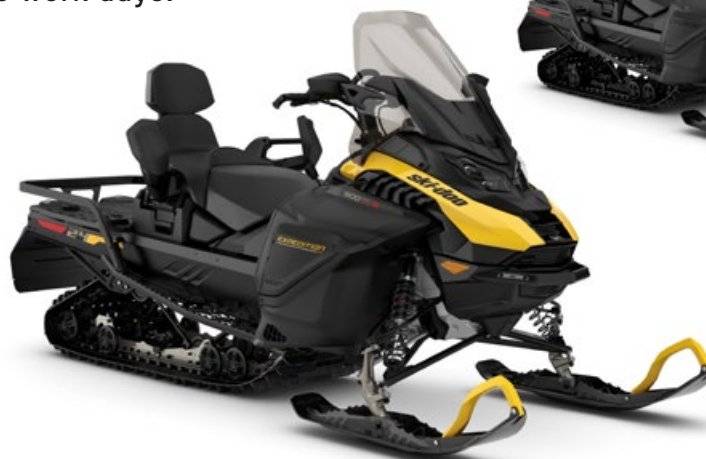
EXPEDITION LE 900 ACE TURBO R SHOWN