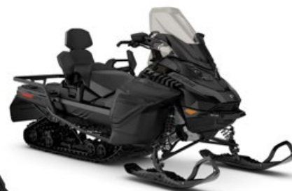
EXPEDITION LE 900 ACE TURBO R SHOWN

A crossover sport-utility vehicle capable of off-trail exploration, on-trail cruises and enjoyable work days.