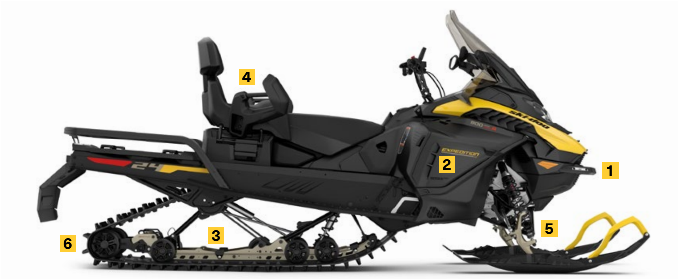
EXPEDITION® LE 900 ACE™ TURBO R SHOWN

Perfectly balanced vehicle dynamics deliver unmatched versatility that's agile and capable both on- and off-trail. With increased travel for a more capable and comfortable riding experience for performance both with and without a load.