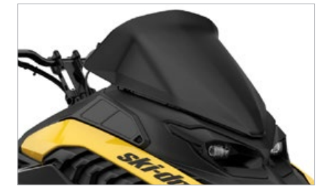
6 Low opaque windshield

New light windshield that matches the modern look of the Gen5 platform. With esthetic deflector trims, textured for better scuff resistance and good wind protection.