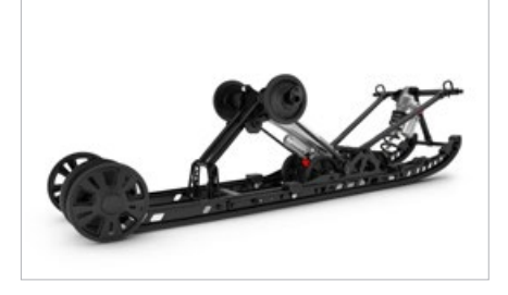
4 cMotion X rear suspension

Completely new lighter design is better balanced for performance on- and off-trail. Perfectly balanced weight transfer for an increased fun factor and more travel for more comfort and bump absorption.