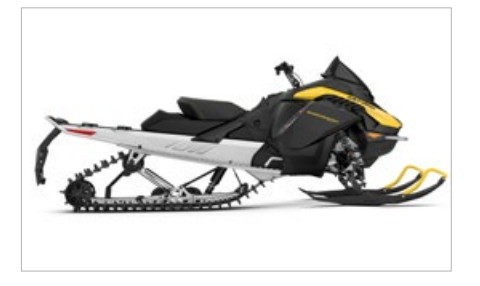
1 REV Gen5 narrow platform

A sleek design that brings a whole new level of refinement, performance and good looks to the trails.