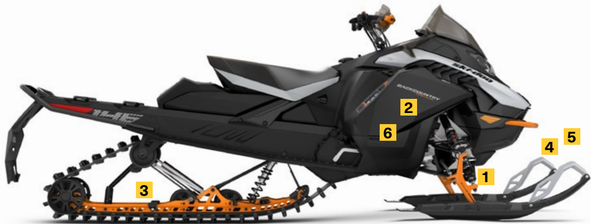
BACKCOUNTRY ADRENALINE 146 850 E-TEC SHOWN

Completely new lighter design is better balanced for performance on- and off-trail. Perfectly balanced weight transfer for an increased fun factor and more travel for more comfort and bump absorption.