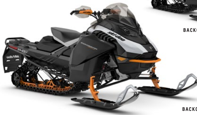
BACKCOUNTRY ADRENALINE 146 850 E-TEC SHOWN