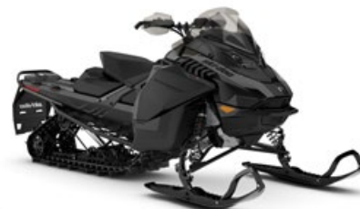
BACKCOUNTRY ADRENALINE 146 600R E-TEC SHOWN

Loaded with crossover-specific features for spending equal time riding on- or off-trail.