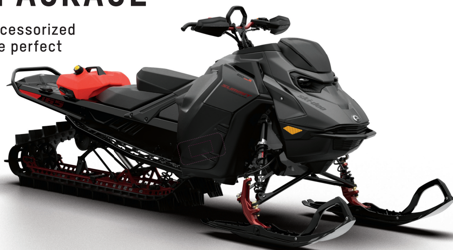
SUMMIT ADRENALINE WITH EDGE PACKAGE 165 850 E-TEC TURBO R SHOWN

Ready for adventure: fully accessorized with all the essentials for the perfect day on the snow.