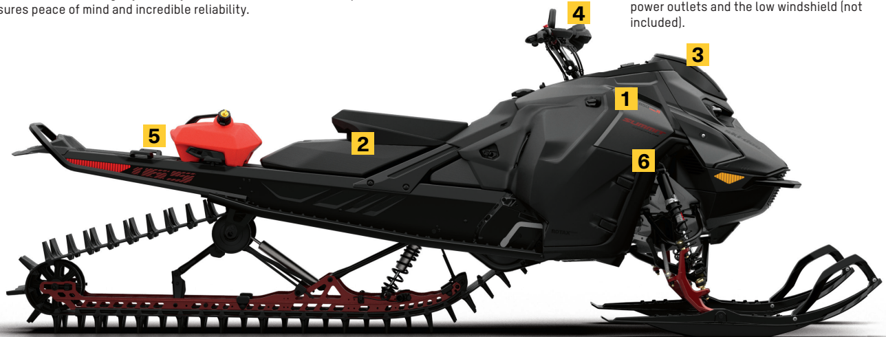
SUMMIT ADRENALINE WITH EDGE PACKAGE 165 850 E-TEC TURBO R SHOWN

The Soft Glove Box adds some easily accessible storage. The semi-rigid construction is durable and water-resistant while adding 30% more capacity, including a separate inner cell phone compartment. The bright yellow interior makes it easier to spot items and offers more protection to the things inside. Works with USB and 12-volt power outlets and the low windshield (not included).