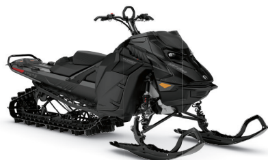
SUMMIT ADRENALINE WITH EDGE PACKAGE 154 850 E-TEC SHOWN

This high-end in-season package is loaded with proven technical features.