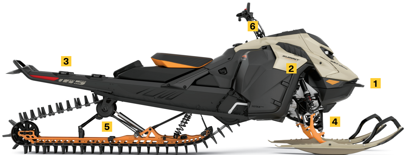
SUMMIT ADRENALINE WITH EDGE PACKAGE 165 850 E-TEC SHOWN

Shorter tunnel length without snowflap for greater deep-snow capabilities with more clearance and lighter overall weight. Standard rear fender with LinQ-ready attachment points.