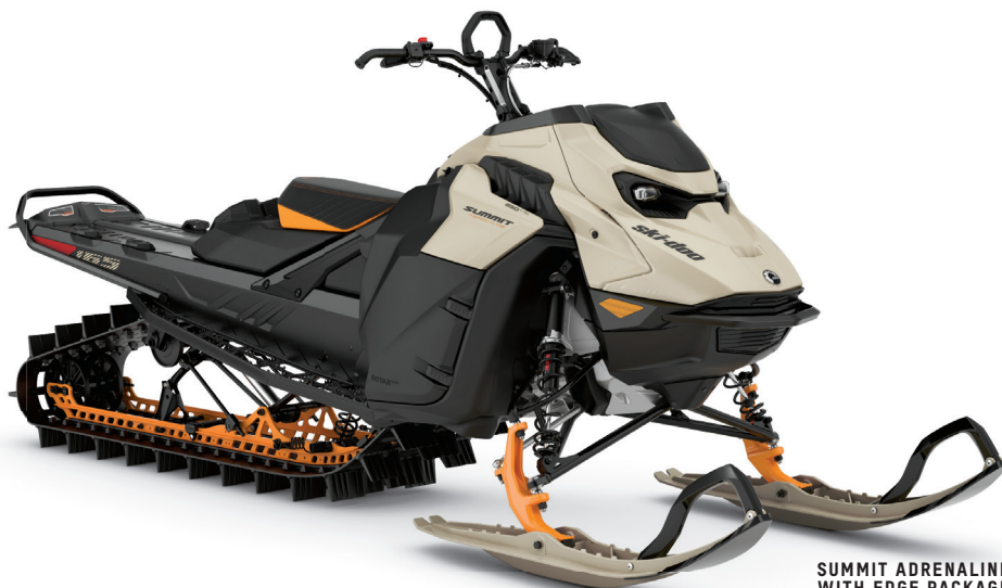
SUMMIT ADRENALINE WITH EDGE PACKAGE 165 850 E-TEC SHOWN