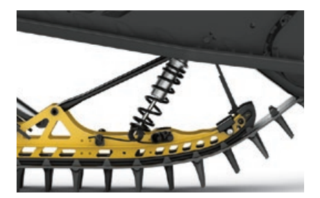
4 High-quality HPG shock package Extremely capable high-pressure gas shocks by KYB.<sup>1</sup>