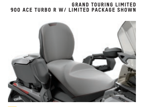
6 Heated 2-up seat Premium 2-up heated seat with backrest, including handholds.