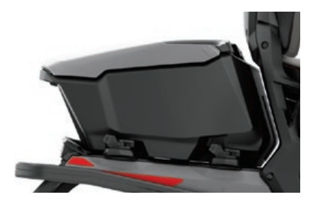
5 Large cargo box Hard-top weather-resistant LinQ box adds 62 L (16.1 gal) of storage on the tunnel.

rMotion X redefines big-bump capability in the harshest terrain, while improving overall handling thanks to a longer front arm with adjustableangle design. Combined with ACS and its on-thefly preload settings, you have the best of both handling and adjustable comfort.