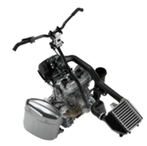
1 Rotax 900 ACE Turbo R engine

Now the most powerful 4-stroke engine ever offered in a Ski-Doo. Ferocious instant acceleration and top speed through bigger fuel injectors, increased boost and optimized intake and exhaust systems. The new cable activated iTC throttle better matches a performance rider's profile while offering three driving modes.