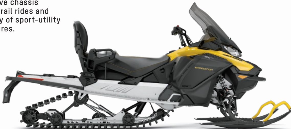
EXPEDITION SPORT 900 ACE SHOWN

Ultra-responsive chassis for on- or off-trail rides and extensive array of sport-utility and 2-up features.