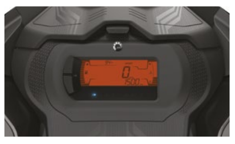
4.5-in. digital display All-digital LCD gauge cluster with flatter viewing angle for an easy-to-read info center whether standing or sitting.

Push-button starting with almost no added weight. Uses energy stored in the lightweight ultracapacitor to turn the magneto and with E-TEC<sup>®</sup> technology, starts the engine.