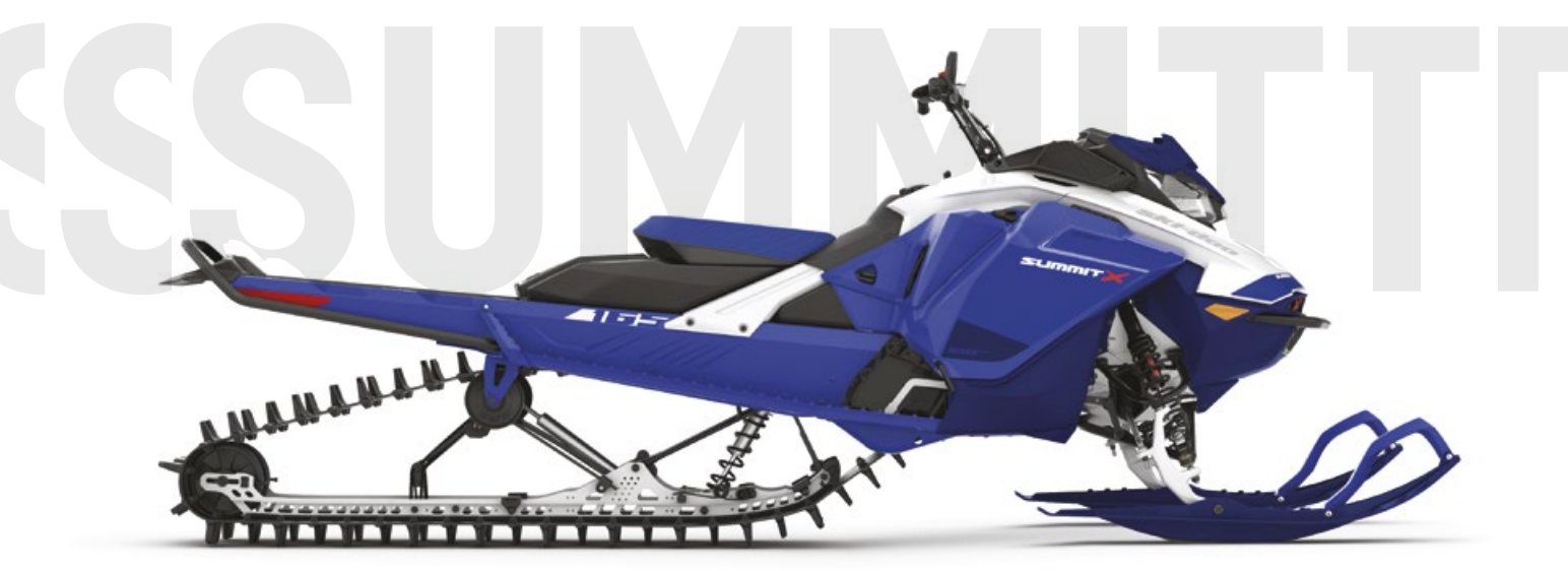
SUMMIT° X° 165 850 E-TEC° SHOWN