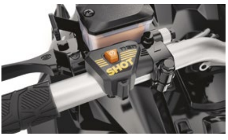
E-TEC° SHOT<sup>™</sup> starter

Front to back extruded grid-style board allowing snow to pass easily through, preventing washout and trenching, plus clears footrests for grip. Flatter foot position for comfort and control.