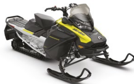
RENEGADE® SPORT 600 ACE™ SHOWN