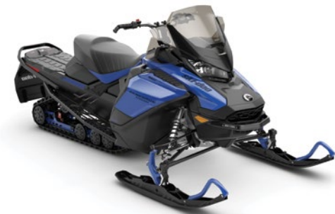
RENEGADE® ENDURO™ 850 E-TEC® SHOWN