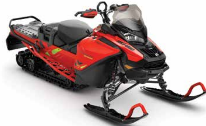
EXPEDITION® XTREME 850 E-TEC SHOWN