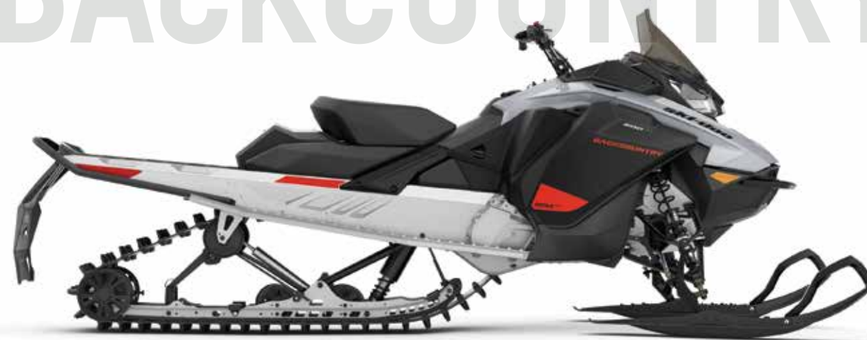
BACKCOUNTRY™ SPORT SHOWN