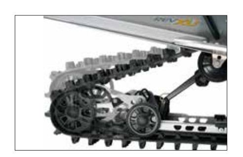
SC<sup>™</sup>-5U articulating rear suspension

New design, including taller lugs, significantly improves acceleration and deep snow performance.