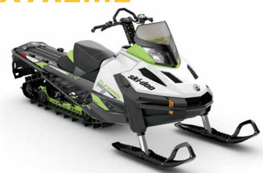
TUNDRA™ XTREME 600 H.O. E-TEC® shown