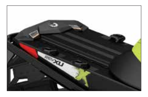
LinQ™ cargo system included

Our cargo attachment system is the hassle-free way to connect cargo bags or a fuel caddy to your sled in seconds.