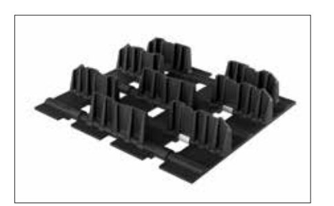
16 x 154 x 2.5 in. ProLite track

Extremely narrow in front and low profile for easily passing legs from side to side. 3.2 L (0.8 US gal) of storage in seat base.