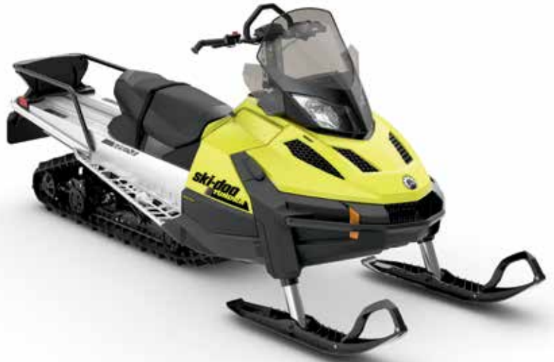
TUNDRA™ LT 550 Fan shown