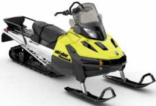
TUNDRA™ LT 600 ACE™ shown