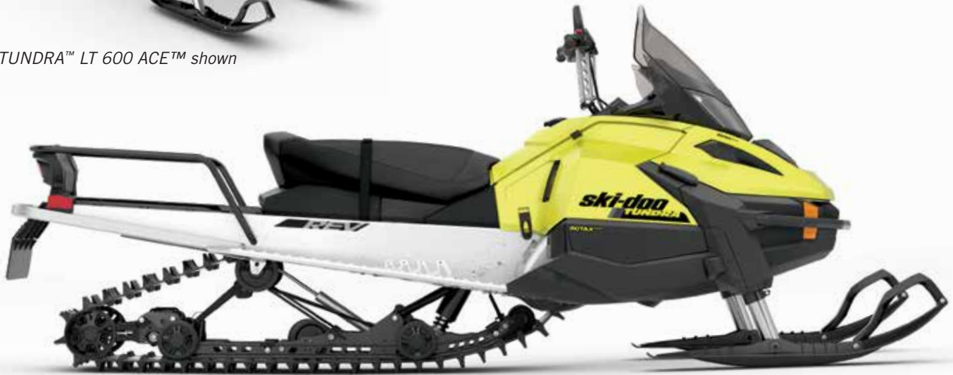
TUNDRA™ LT 600 ACE™ shown