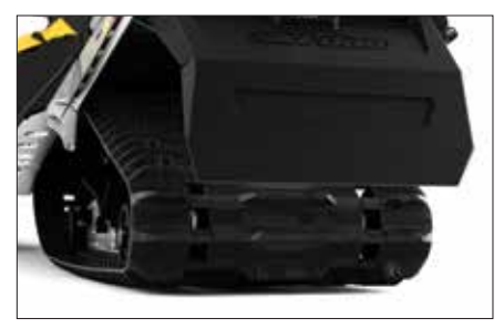
24 in. Super Wide Track (SWT) The industry's largest footprint provides unmatched traction and helps achieve the lowest ground pressure in snowmobiling.