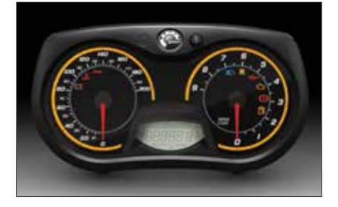
Analog gauge with display