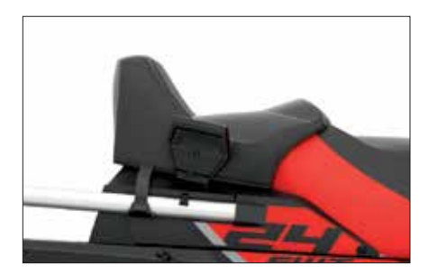
Utility 2-up seat with passenger handholds 2-up seat with integrated back support, including handholds.

Take off from a stop smoothly, even with a heavy load, thanks to two forward and one reverse gears. Inline 2-1-N-R pattern on right side and can be safely shifted while on the fly.