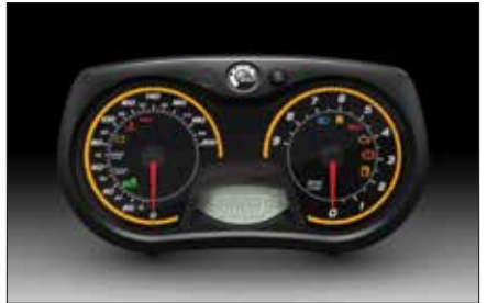
Analog gauge with display