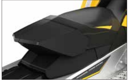
Comfortable REV-XP™ seat Sleek, yet comfortable. Includes trunk with 7 L (1.9 US gal).