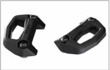
LinQ™ cargo system (option) Our cargo attachment system is the hassle-free way to connect cargo bags or a fuel caddy to your sled in seconds.