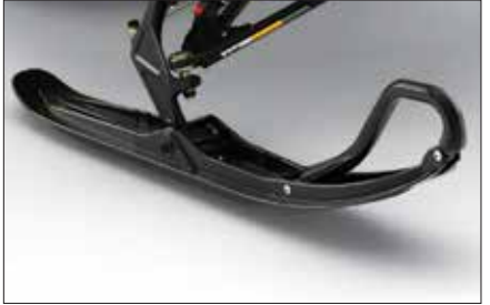
Pilot™ 5.7 skis Deliver outstanding grip and bite in corners with virtually no darting.