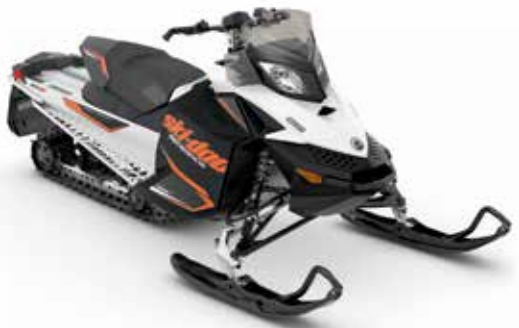
RENEGADE® SPORT 600 Carb shown