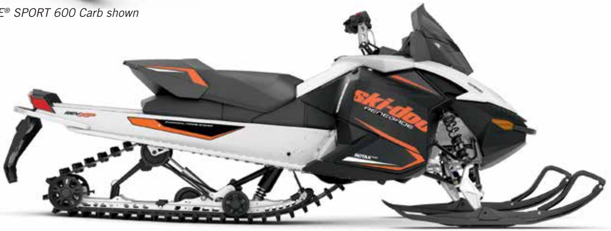
RENEGADE® SPORT 600 Carb shown