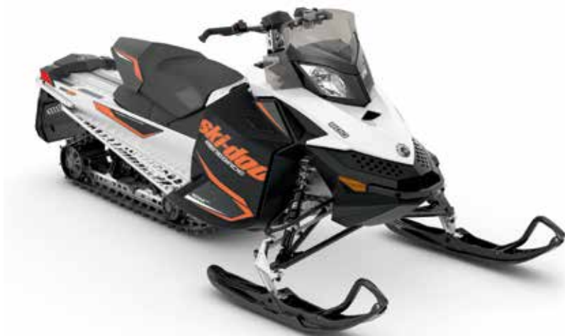
RENEGADE® SPORT 600 Carb shown