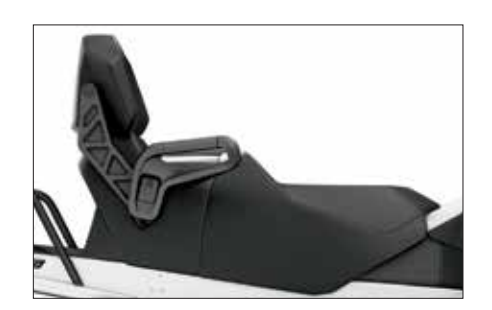
2-up seat with passenger handholds Comfortable 2-up seat with backrest, including handholds.