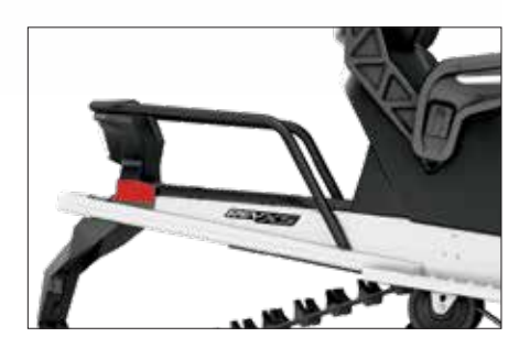
Lightweight aluminum rack 50 pound (23 kg) cargo capacity.