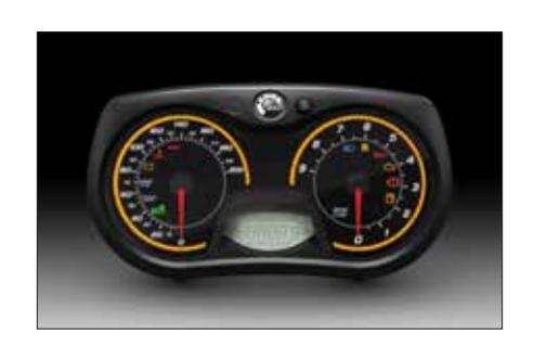
Analog gauge with display