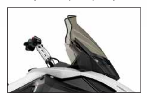
High Windshield Sculpted to offer improved rider and passenger wind deflection.