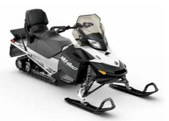
EXPEDITION® SPORT 550 Fan shown