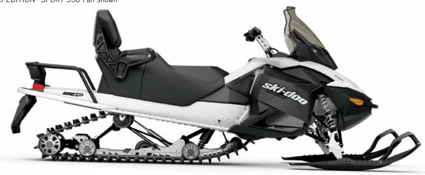
EXPEDITION® SPORT 550 Fan shown