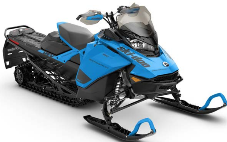
BACKCOUNTRY™ 850 E-TEC® shown