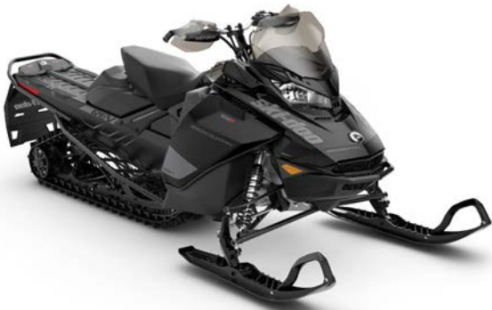
BACKCOUNTRY™ 600R E-TEC® shown