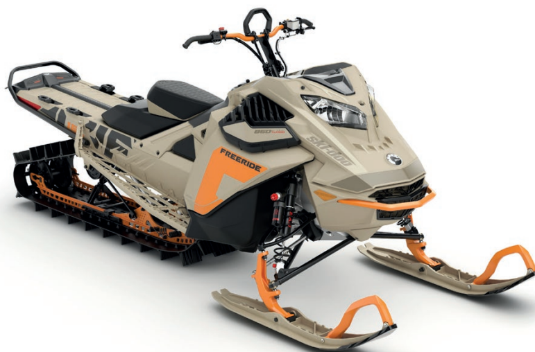
FREERIDE® 165 850 E-TEC® TURBO SHOWN