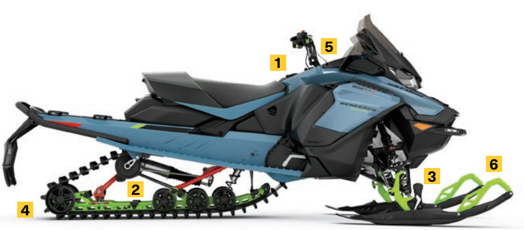
RENEGADE® ENDURO™ 900 ACE™ TURBO R SHOWN

Flatter cornering and precision handling in all conditions. Developed in tandem with the rMotion X rear suspension to raise the bar in trail snowmobile chassis performance. Wider, adjustable ski stance and +10 mm of suspension stroke maximize stability, capability and comfort.