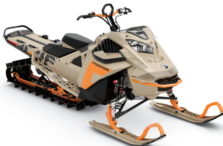
FREERIDE® 165 850 E-TEC® TURBO SHOWN