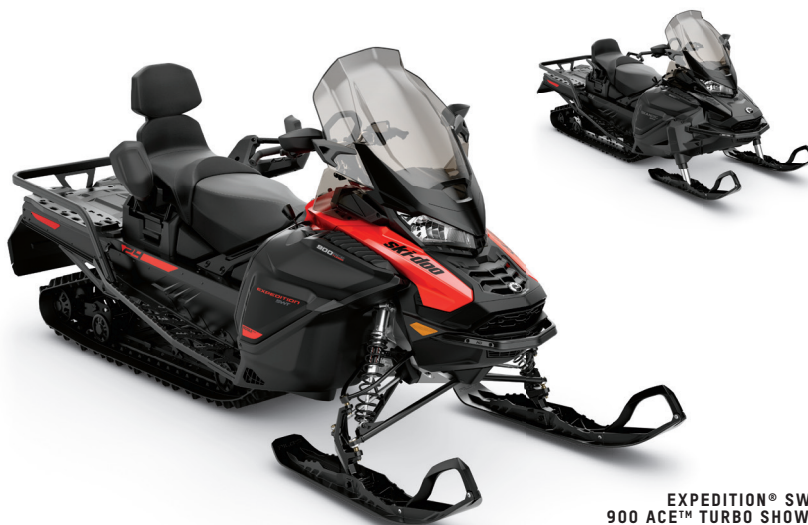
EXPEDITION® SWT 900 ACE™ TURBO SHOWN

A supreme deep-snow sport-utility vehicle with unrivaled flotation and an exemplary list of utility features.