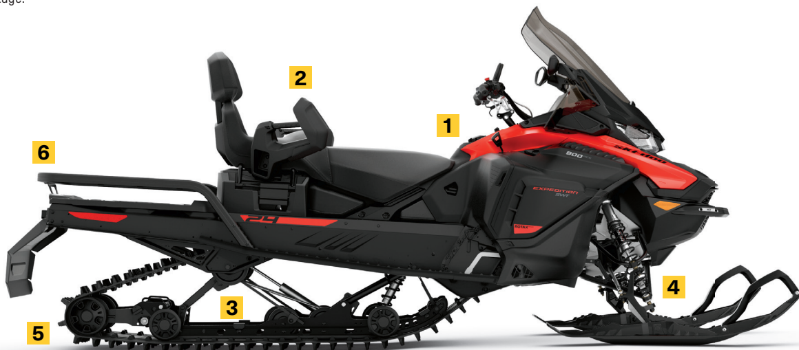
EXPEDITION® SWT 900 ACE™ TURBO SHOWN

The articulated rail maximizes deep-snow traction in reverse, and its toolless locking mechanism is ideal for towing.