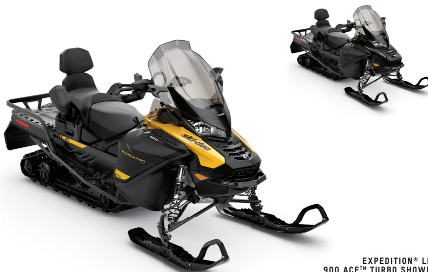
EXPEDITION® LE 900 ACE™ TURBO SHOWN

A hybrid touring sport-utility vehicle with premium features for off-trail exploration and on-trail cruises.