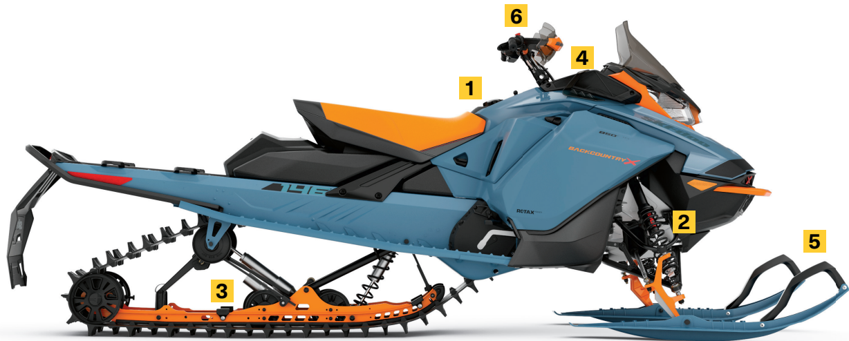
BACKCOUNTRY™ X® 146 850 E-TEC® SHOWN

Crossover-specific suspension uses best principles of the rMotion™ trail and tMotion™ mountain skids for confident cornering and agile boondocking.