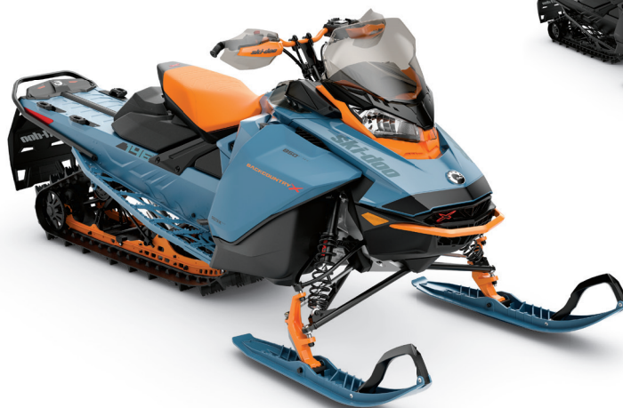
BACKCOUNTRY™ X® 146 850 E-TEC® SHOWN

A 50-50 sled with the most advanced technology, plus off-trail capability and rough-trail performance.